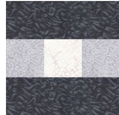
Star Bright A

Cut 2, 6 1/2" x 2 1/2" rectangles, cut 3, 2 1/2" x 2 1/2" squares