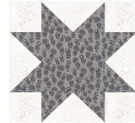
Variable Star Block

Cut four 2 7/8" squares cut diagonally once = 8 triangles